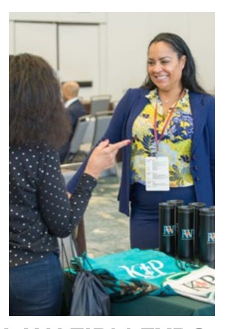
LAW FIRM EXPO

The General Counsel Roundtable, Signature Lunch Panel, and similar sessions bring together top legal experts, industry leaders, and influential figures to discuss key legal and business matters, fostering knowledge exchange, collaboration, and innovation within the Section.